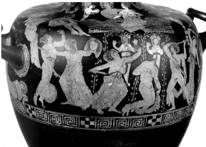
Figure 2. Lykourgos murdering Dryas. Athenian red-figure hydria. Rome, Villa Giulia 55707. ARV 2 1343.