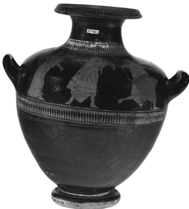
Figure 5. Sparagmos of Dryas. Athenian red-figure hydria. London, British Museum E 246.