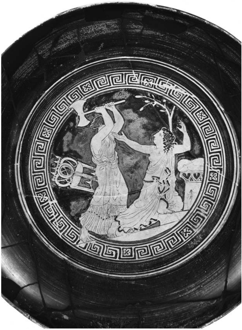
Figure 3. Klytaimnestra murdering Cassandra. Athenian red-figure kylix tondo attributed to the Marlay Painter. Ferrara, Museo Nazionale di Spina 2482. ARI 2 1280.64, 1689.