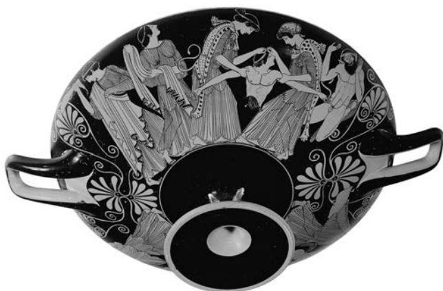
Figure 4. Death of Pentheus. Athenian red-figure kylix attributed to Douris. Fort Worth, Kimbell Art Museum.