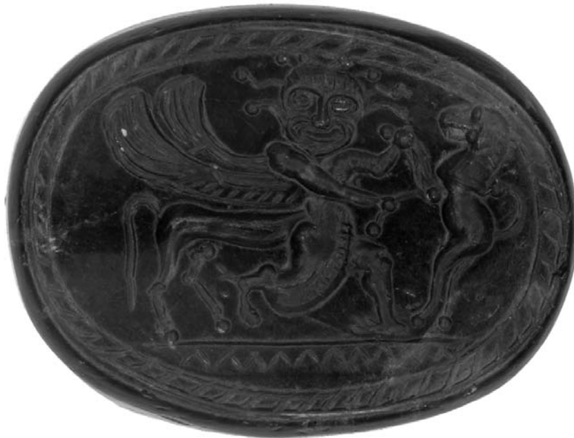
Fig. 2. Winged Gorgon with horse's body confronting lion. Amethyst scarab (London, British Museum WA 103307)