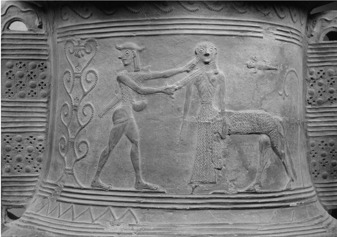
Fig. 1. Perseus killing Medusa. Cycladic relief pithos (neck detail) (Paris, Musée du Louvre CA 795)