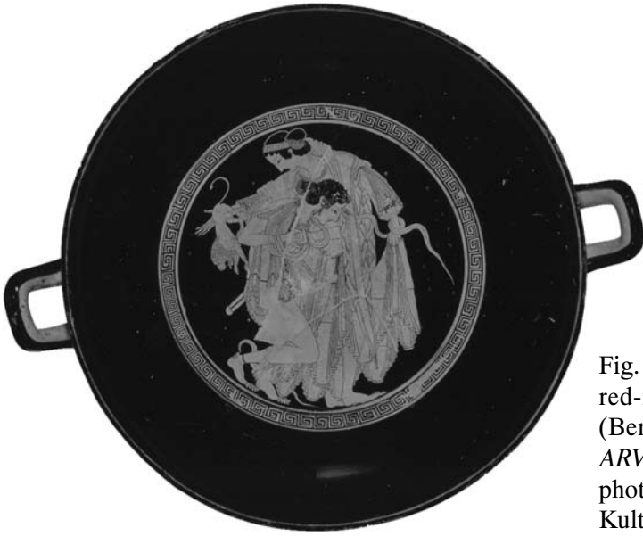
Fig. 3. Peleus wrestling Thetis, Attic red-figure kylix tondo, Peithinos (Berlin, Antikensammlung F 2279; ARV 2 115.2, 1626; Para. 332; Add. 2 174; photo credit: Bildarchiv Preussischer Kulturbesitz/Art Resource NY)